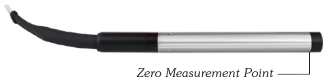
Zero Measurement Point

The temperature sensor is located at the stainless steel tip of the probe, however, since the probe body acts as a heat sink, best accuracy is obtained when the probe is completely submerged. The tape seal plug design allows the probe to be easily replaced, if required.